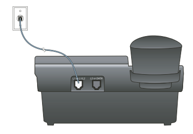
Line 1 + Line 2

1. Connect the line cord to the telephone base and wall jack.